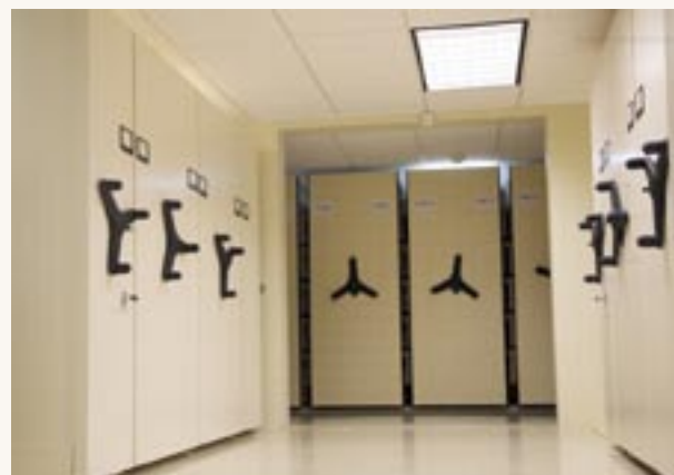
Expanded Archives Repository

cultural development, education, telecommunications, transport and shipping, the military and regional security, meteorology and disaster mitigation in the region. The Centre has been providing top quality research services to a number of overseas academics from universities and colleges in North America and the United Kingdom as well as those in the Campus Community. These researchers have benefited from the upgraded, on-line, searchable Archives database (WebGencat) before arriving to conduct research in the newly design Reading Room. Complementary sources such as audio-visual and photographic material enhance the research experience.